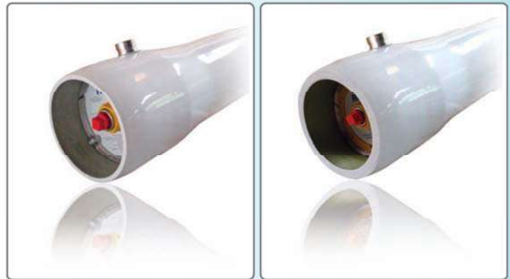
Low Pressure Vessel

The ROPV R80S series model accommodates standard make 8" membrane filtration elements. Manufactured to very exacting specifications with only the highest quality materials for continuous use. Our pressure vessels operate within a temperature range of 14–150°F (-10–66°C), at operating pressures of up to 1,200 PSI / 83 Bar. Individual units are hydro-tested prior to shipment to ensure only the highest quality and stable performance. The R80S series model is certified and meets the standards of the ASME [American Society of Mechanical Engineers], Section X, RP.