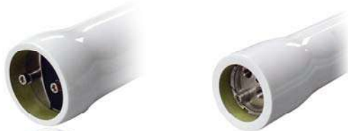
Low Pressure Vessel