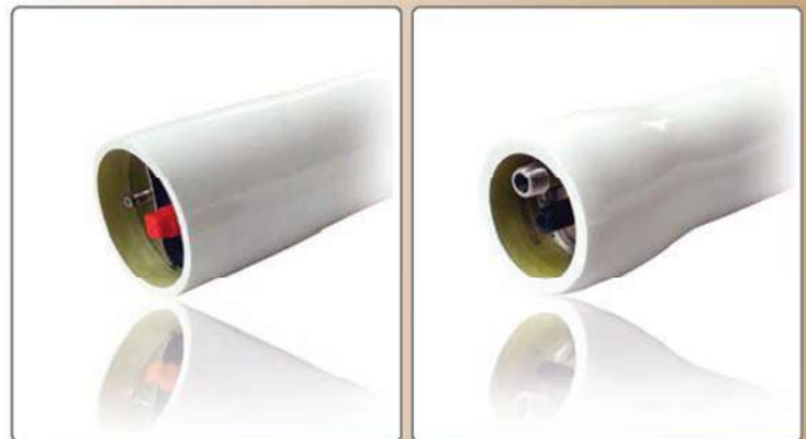
Low Pressure Vessel

The ROPV R40E series model accommodates standard make 4" membrane filtration elements. Manufactured to very exacting specifications with only the highest quality materials for continuous use. Our pressure vessels operate within a temperature range of 14–150°F (-10–66°C), at operating pressures of up to 1,200 PSI / 83 Bar. Individual units are hydro-tested prior to shipment to ensure only the highest quality and stable performance.