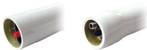
Low Pressure Vessel