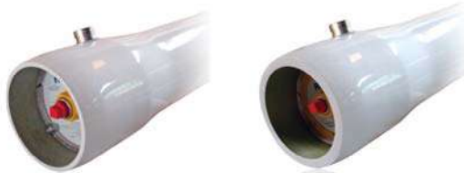
Low Pressure Vessel