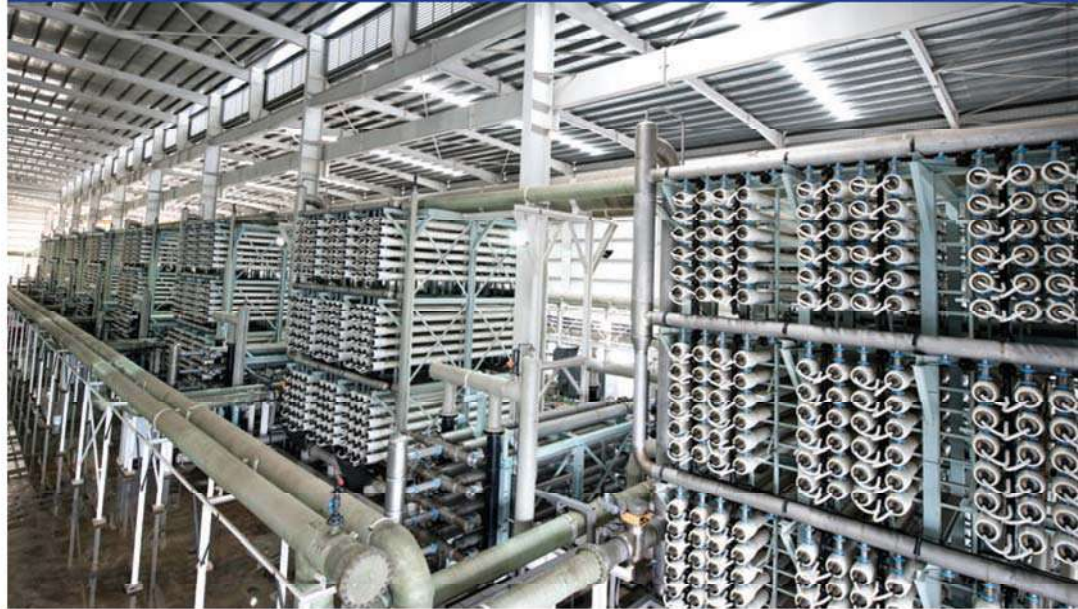
Aerial view rendering of the Tuaspring Seawater Desalination Plant courtesy of Hyflux.