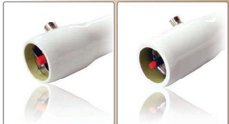
Low Pressure Vessel

The ROPV R40S series model accommodates standard make 4" membrane filtration elements. Manufactured to very exacting specifications with only the highest quality materials for continuous use. Our pressure vessels operate within a temperature range of 14–150°F (-10–66°C), at operating pressures of up to 1,200 PSI / 83 Bar. Individual units are hydro-tested prior to shipment to ensure only the highest quality and stable performance.