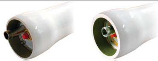
Low Pressure Vessel