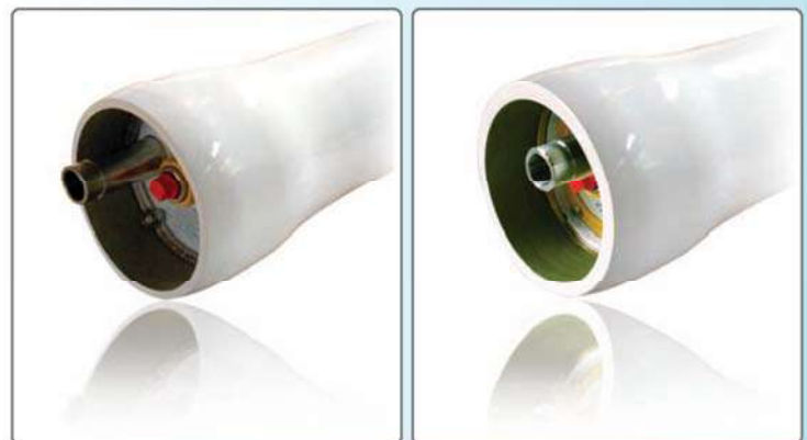
Low Pressure Vessel

The ROPV R80E series model accommodates standard make 8" membrane filtration elements. Manufactured to very exacting specifications with only the highest quality materials for continuous use. Our pressure vessels operate within a temperature range of 14–150°F (-10–66°C), at operating pressures of up to 1,200 PSI / 83 Bar. Individual units are hydro-tested prior to shipment to ensure only the highest quality and stable performance.