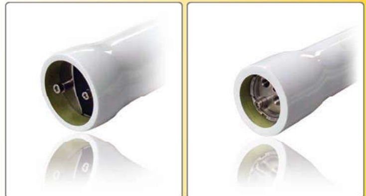
Low Pressure Vessel

The ROPV R25E series model accommodates standard make 2.5" membrane filtration elements. Manufactured to very exacting specifications with only the highest quality materials for continuous use. Our pressure vessels operate within a temperature range of 14–150°F (-10–66°C), at operating pressures of up to 1,000 PSI / 69 Bar. Individual units are hydro-tested prior to shipment to ensure only the highest quality and stable performance.